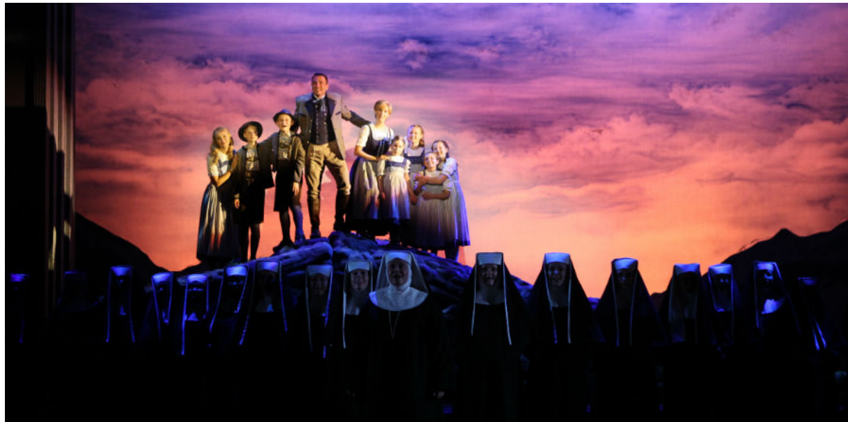
The Von Trapp family say goodbye

to you with this beautiful scene.